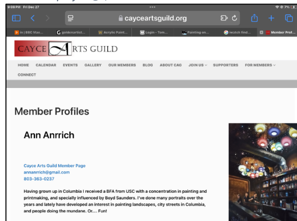
1 Member profile @ $25 level screenshot