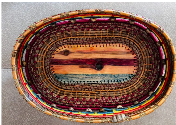
1 Oval pine straw basket with waxed thread stitching in multiple colors and natural stone beads. Wood base with watercolor stain sunset painting. 9x12.5x3.5

Lisa A. Alberghini, Alberghini Art Facebook: AlberghiniArt@facebook.com Instagram: AlberghiniArt@instagram.com