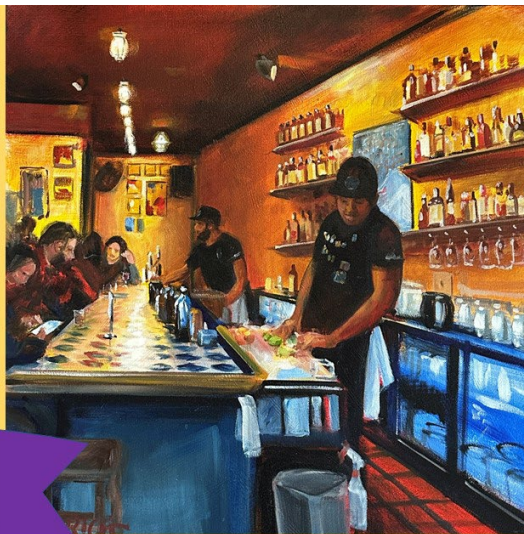
Cayce Arts Guild 2025 Still Hopes Show