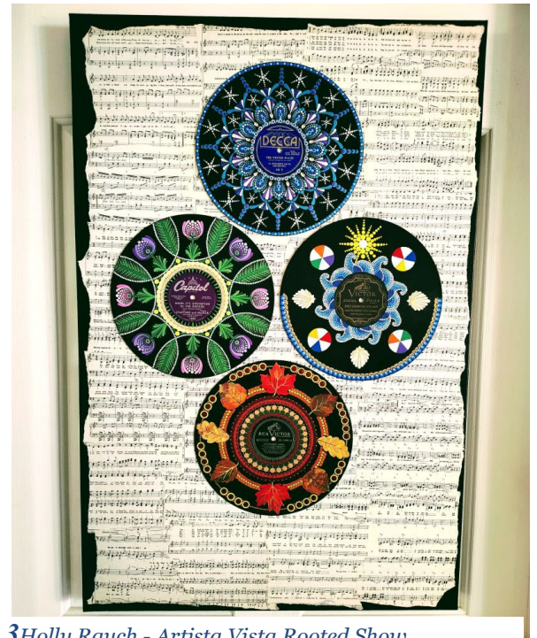
3 Holly Rauch - Artista Vista Rooted Show

Do you have news of activities that fellow Guild members need to know? Send information to caycartsguild@gmail.com . Include in the subject line "newsletter."