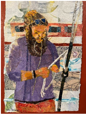
4 Boat Man Boston Liberty Clipper

Several members also will participate in the Artista Vista free Live Maker's Mart on Saturday, April 18, 11 a.m. – 4 p.m. (516 Senate St.)